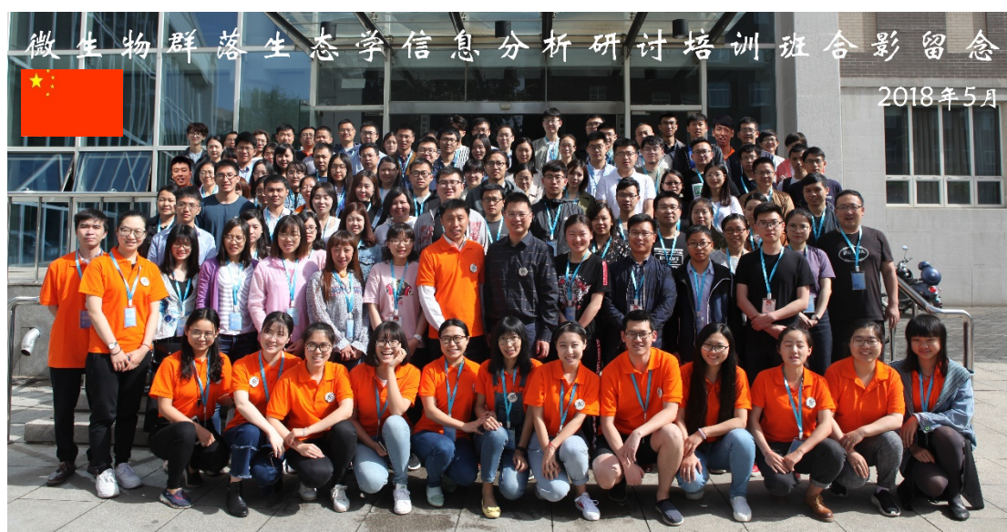
Photo 1. All attendees and volunteers for the seminar of bioinformatics analysis in microbial ecology

The seminar is based on analysis and data mining foundation of microbial community ecology. We focused on three important issues of microbial ecology. (i) How to choose detection technology? (ii) How to get microbial community composition and diversity information? (iii) How to further dig out the information? The lessons included survey of microbial ecology, application and analysis of metagenomic molecular detection, preliminary treatment of sequencing data, as well as analysis and statistical method of community diversity.